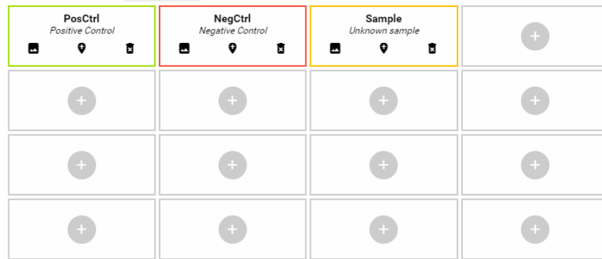
Fig 1. Cartridge set-up

Kits components are intended, developed, designed, and sold for Research Purpose Only. Product claims are subject to change. Therefore, please refer to our website (www.hyris.net) for the most up-to-date information on Hyris Ltd products.