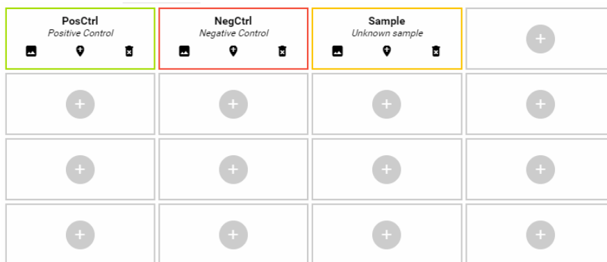
Fig 1. Cartridge set-up

The Kits may require the use of Taq Polymerase enzyme, DNA binding components and fluorochromes/quencher, often registered as trademark by companies. TagMan® is a trademark of Roche Molecular Systems, Inc. FAM™, HEX™ and ROX™ are a trademark of Thermo Fisher Scientific or its subsidiaries. SYBR is a registered trademark of Molecular Probes, Inc. (Thermo Fisher Scientific). MGB probes are a trademark of Elitech group. The Kits have been internally tested by our quality control. Any responsibility is waived if the warranty of quality control does not refer to the specific Kits. The user is personally responsible for data that he/she will obtain and/or he/she will supply to third parties using these kits. Once the sealed package is opened the user accepts all the conditions without fail; if the package is still sealed the kit can be returned and the user can be refunded. Kits components are intended, developed, designed, and sold for Research Purpose Only. Product claims are subject to change. Therefore, please refer to our website (www.hyris.net) for the most up-to-date information on Hyris Ltd products.