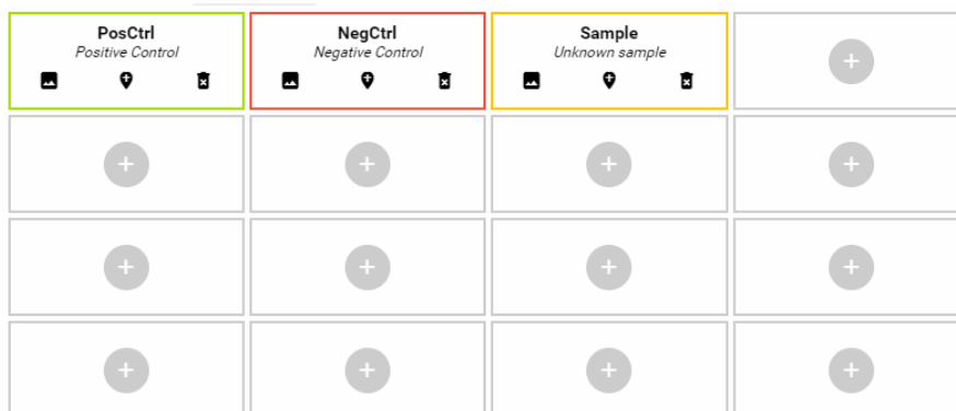
Fig 1. Cartridge set-up

The Kits may require the use of Taq Polymerase enzyme, DNA binding components and fluorochromes/quencher, often registered as trademark by companies. TagMan® is a trademark of Roche Molecular Systems, Inc. FAM™, HEX™ and ROX™ are a trademark of Thermo Fisher Scientific or its subsidiaries. SYBR is a registered trademark of Molecular Probes, Inc. (Thermo Fisher Scientific). MGB probes are a trademark of Elitech group. The Kits have been internally tested by our quality control. Any responsibility is waived if the warranty of quality control does not refer to the specific Kits. The user is personally responsible for data that he/she will obtain and/or he/she will supply to third parties using these kits. Once the sealed package is opened the user accepts all the conditions without fail; if the package is still sealed the kit can be returned and the user can be refunded. Kits components are intended, developed, designed, and sold for Research Purpose Only. Product claims are subject to change. Therefore, please refer to our website (www.hyris.net) for the most up-to-date information on Hyris Ltd products.