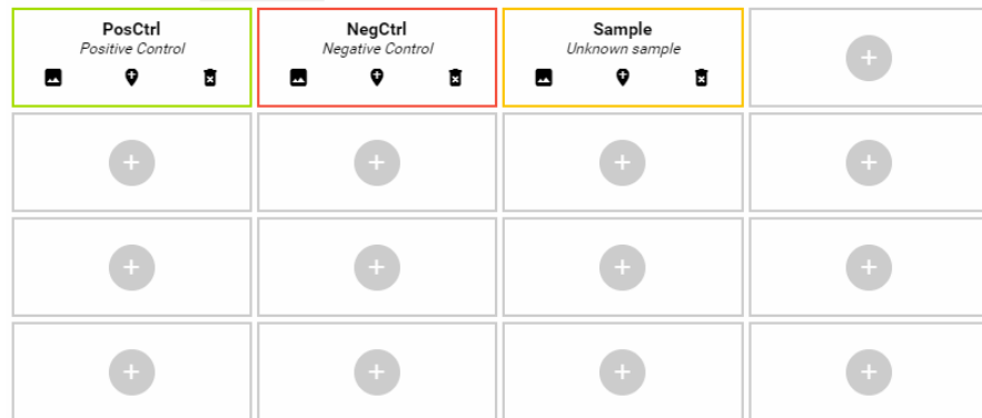
Fig 1. Cartridge set-up

The Kits may require the use of Taq Polymerase enzyme, DNA binding components and fluorochromes/quencher, often registered as trademark by companies. TagMan® is a trademark of Roche Molecular Systems, Inc. FAM™, HEX™ and ROX™ are a trademark of Thermo Fisher Scientific or its subsidiaries. SYBR is a registered trademark of Molecular Probes, Inc. (Thermo Fisher Scientific). MGB probes are a trademark of Elitech group. The Kits have been internally tested by our quality control. Any responsibility is waived if the warranty of quality control does not refer to the specific Kits. The user is personally responsible for data that he/she will obtain and/or he/she will supply to third parties using these kits. Once the sealed package is opened the user accepts all the conditions without fail; if the package is still sealed the kit can be returned and the user can be refunded. Kits components are intended, developed, designed, and sold for Research Purpose Only. Product claims are subject to change. Therefore, please refer to our website (www.hyris.net) for the most up-to-date information on Hyris Ltd products.