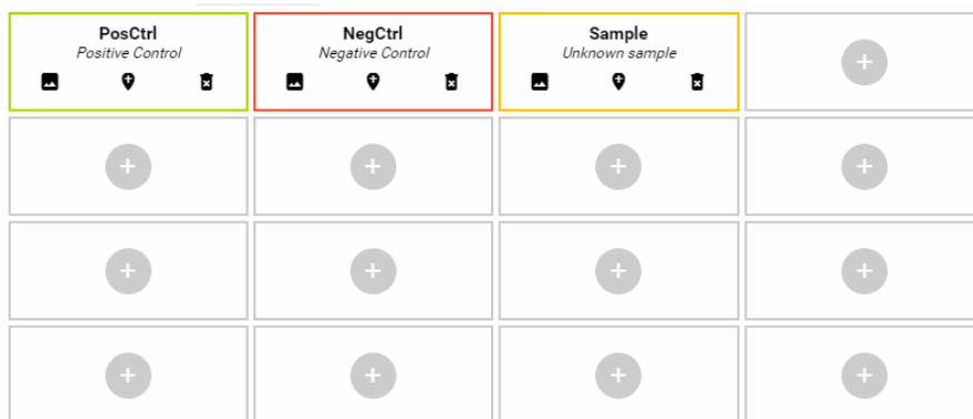
Fig 1. Cartridge set-up

The Kits may require the use of Taq Polymerase enzyme, DNA binding components and fluorochromes/quencher, often registered as trademark by companies. TagMan® is a trademark of Roche Molecular Systems, Inc. FAM™, HEX™ and ROX™ are a trademark of Thermo Fisher Scientific or its subsidiaries. SYBR is a registered trademark of Molecular Probes, Inc. (Thermo Fisher Scientific). MGB probes are a trademark of Elitech group. The Kits have been internally tested by our quality control. Any responsibility is waived if the warranty of quality control does not refer to the specific Kits. The user is personally responsible for data that he/she will obtain and/or he/she will supply to third parties using these kits. Once the sealed package is opened the user accepts all the conditions without fail; if the package is still sealed the kit can be returned and the user can be refunded. Kits components are intended, developed, designed, and sold for Research Purpose Only. Product claims are subject to change. Therefore, please refer to our website (www.hyris.net) for the most up-to-date information on Hyris Ltd products.