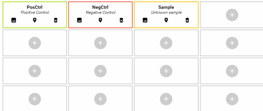
Fig 1. Cartridge set-up

An example of cartridge set-up on the bAPP for one replicate of a sample to be analyzed is shown.